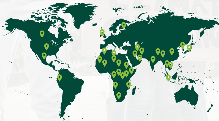
LOCATIONS OF PROJECTS ADDRESSING SDG 13 INCLUDED IN DATABASE

SDG 13 invites the simple and the innovative; and faith groups are responding. Climate Action is inviting all of us – our voices and our actions matter.